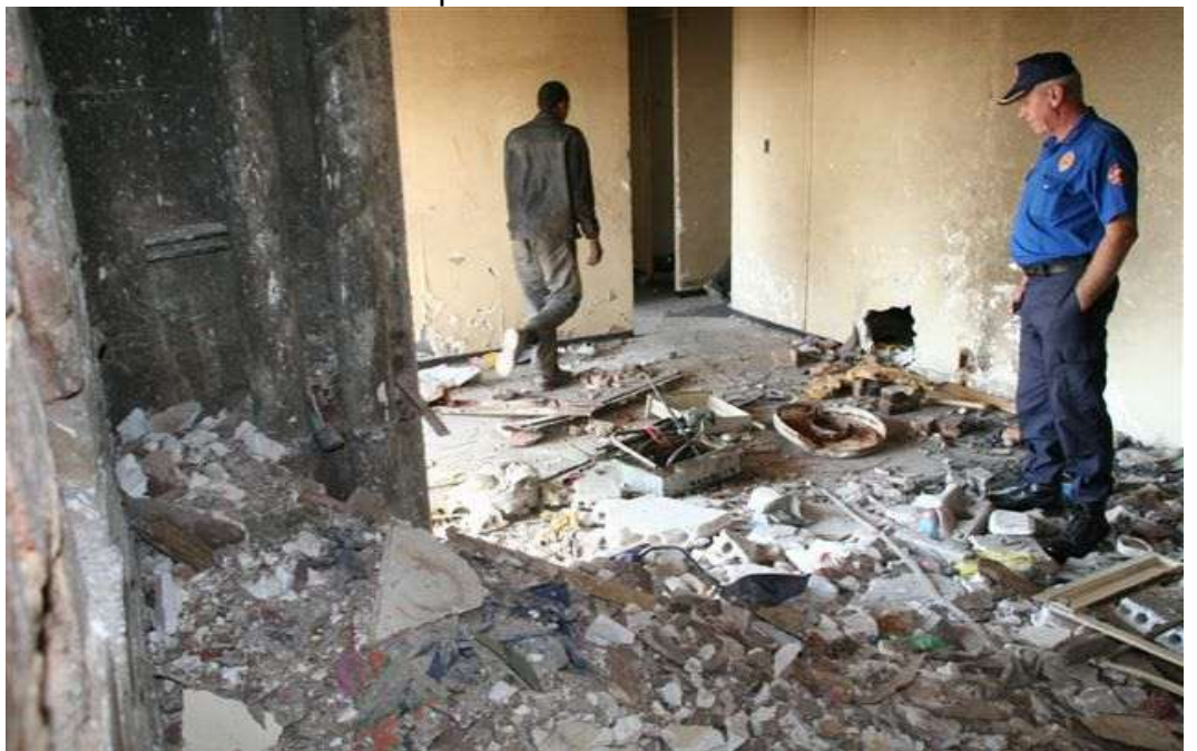
All steel piping, electrical fittings and electrical wiring has been removed