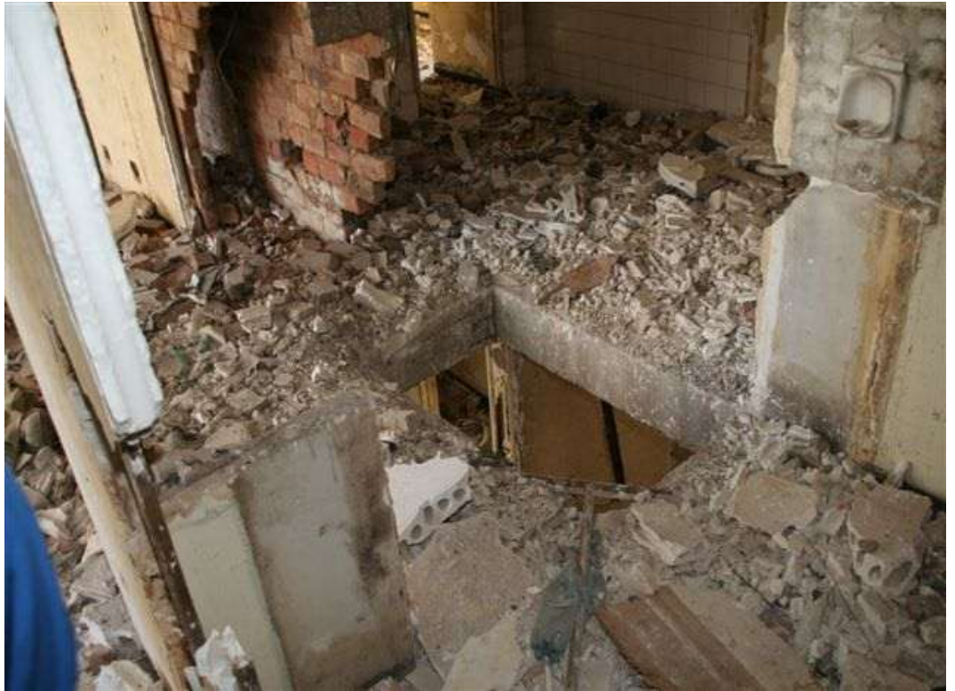
One of the vagrants that were in the process of removing copper wire from the structure, whom was not even perturbed by our presence.