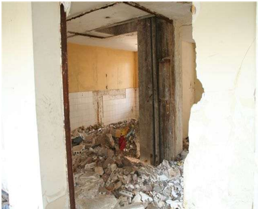
Air-conditioning ducting has been removed and the holes in the floors are ten stories and this was removed by breaking down the internal walls.