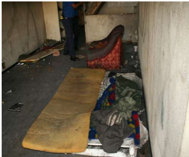
A flat on one of the floors that has been occupied by illegal tenants