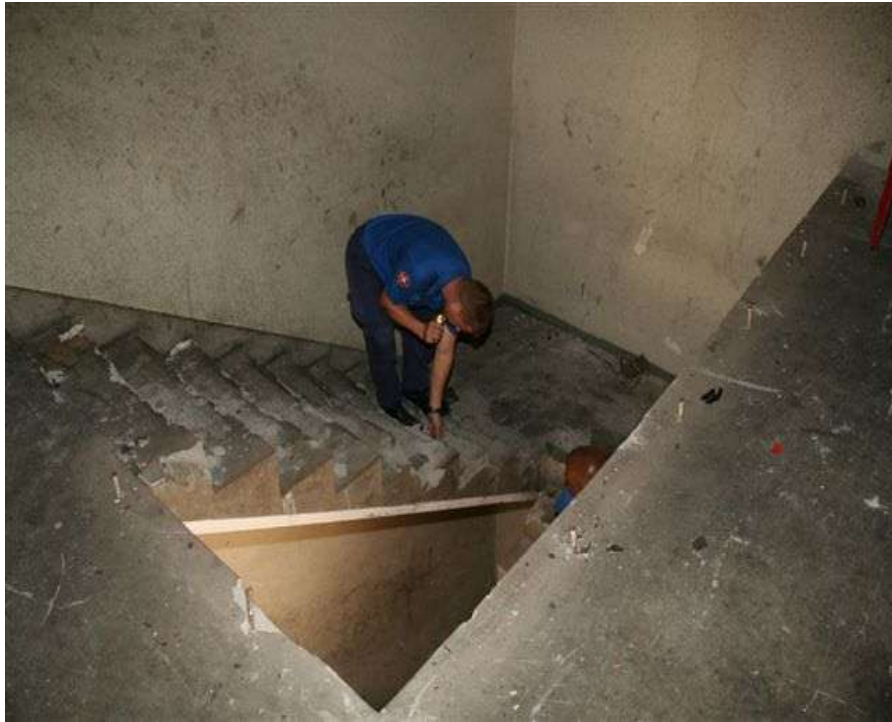
Internal walls have been demolished, thus causing the load on the floor to exceed the permissible weight.