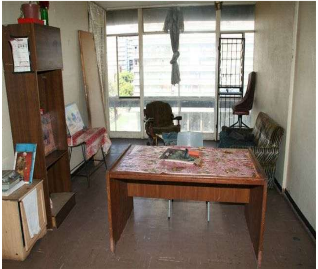
Another room in the flat