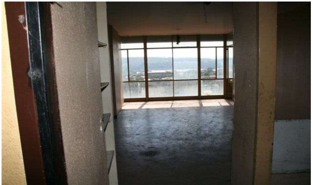
Another occupied flat