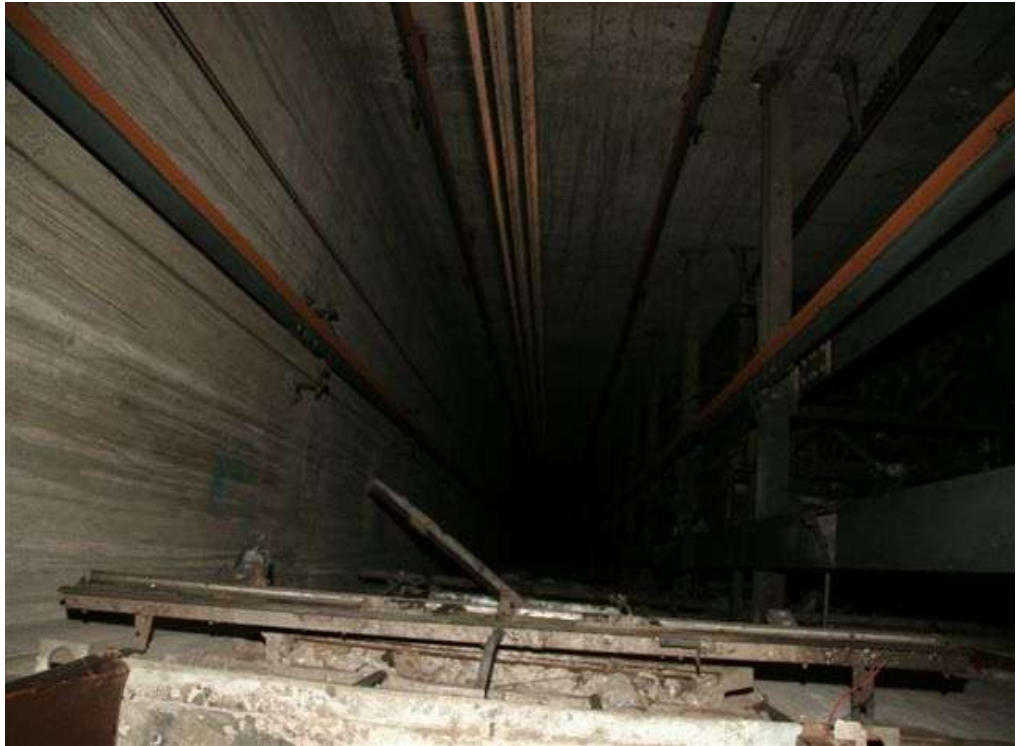
One of the lifts suspended in midair!!!!!!