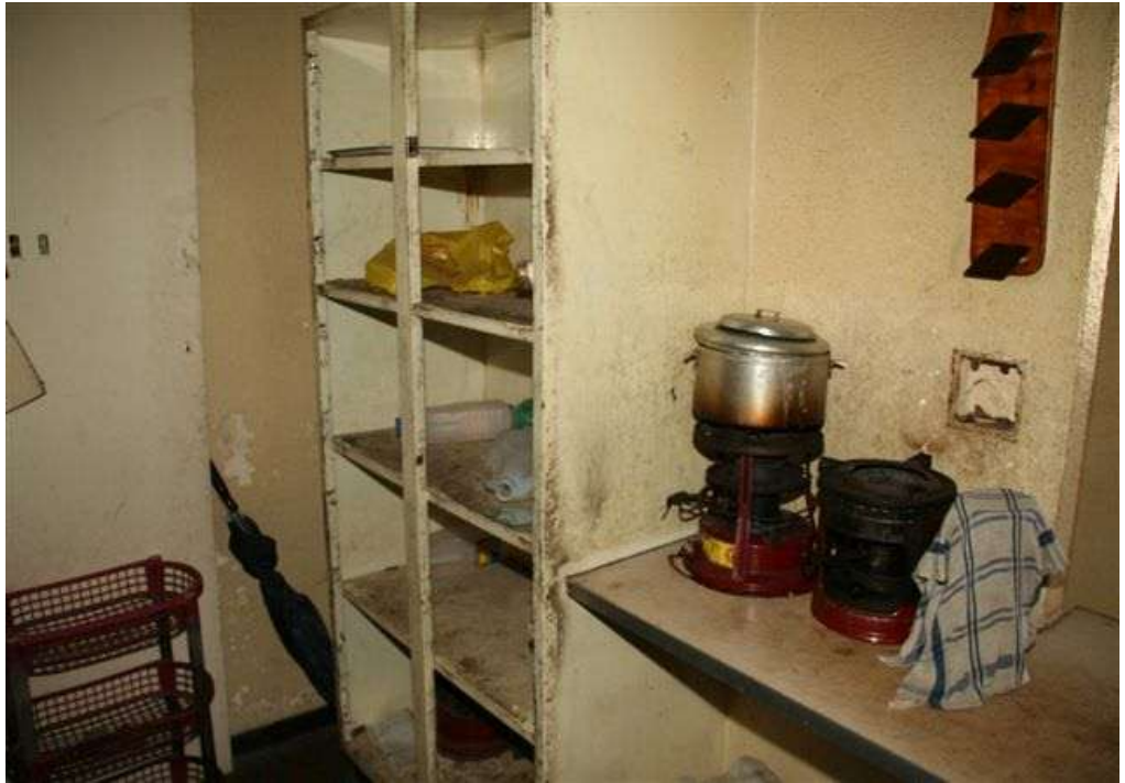
Another flat on approximately 20 th floor that is the process of being occupied seeing that it has been cleaned