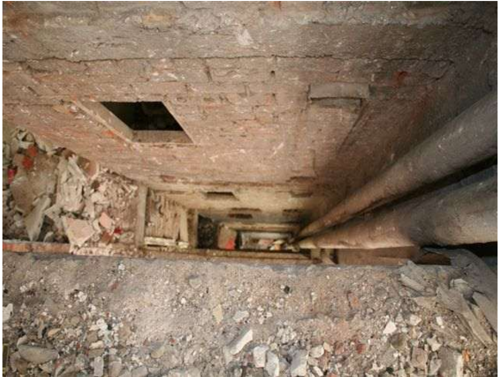
Stairs that have been damaged by the vagrants when they removed the lift motors and lifting mechanisms and dragged them down the stairs.