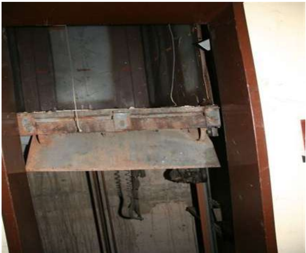
Another lift approximately on 18 th floor which has already been stripped and this is done by climbing into the lift suspended in midair.