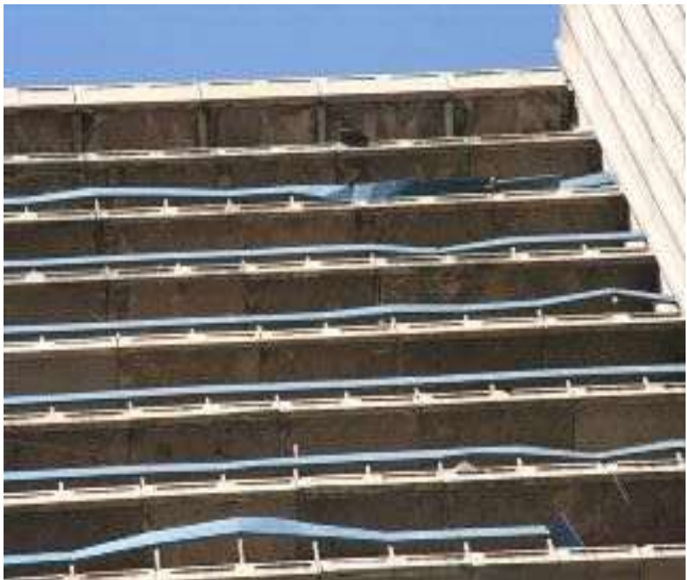
Health hazard and an ideal place for murder and rape to take place as the area is open to the street